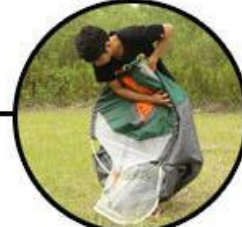
4. Fold the tent in half