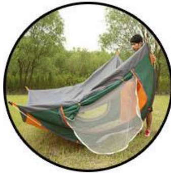
1. Turn the tent upside down