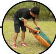
5. Put the tent and accessories into the storage bag