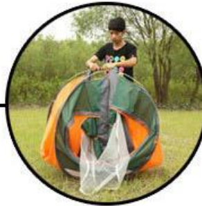
2. Connect the diagonal tent legs