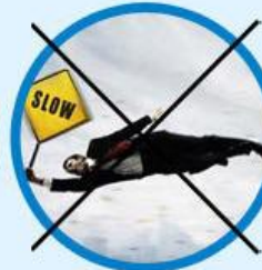
Blown away by the wind