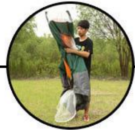
3. Hold the tent in half with both hands and make the tent into a "8" shape