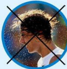
Sultry and airtight