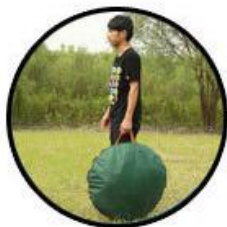
6. The collection is completed