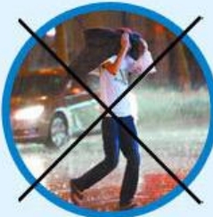
Wet by rain