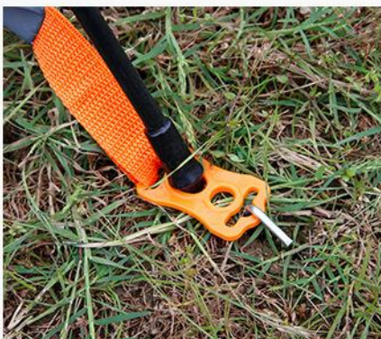
POROUS TENT FEET