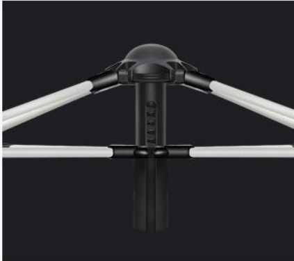
FULLY AUTOMATIC COMPRESSION TENT