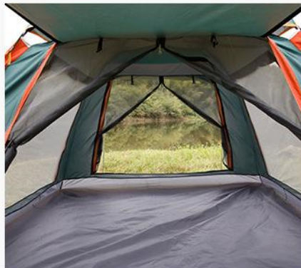
LARGE SPACE / VENTILATION ON ALL SIDES