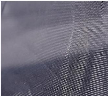
HIGH DENSITY B3 MESH