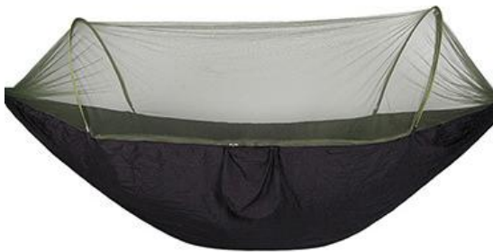
Black (green net)