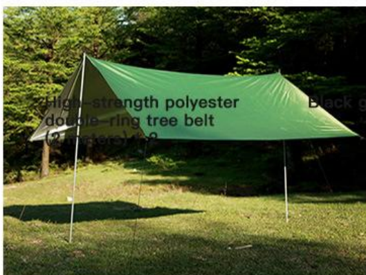
Building with poles