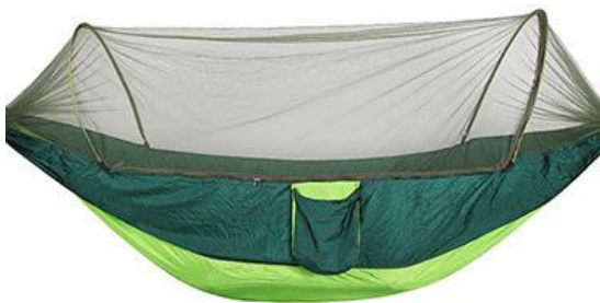
Green Green (Green Net)