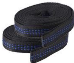
High-strength polyester double-ring tree belt (2 meters) * 2