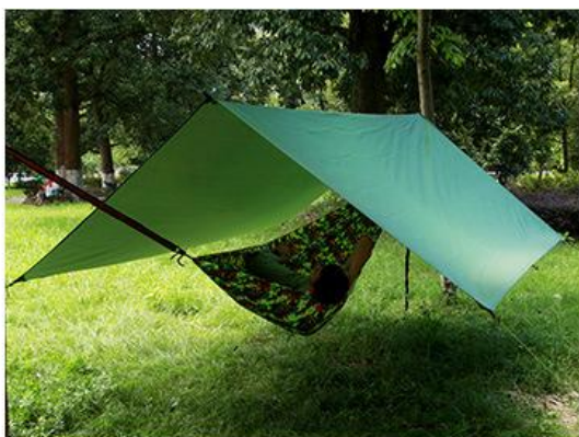
Canopy for hammock