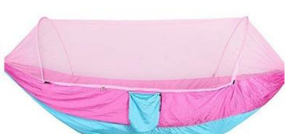
Powder blue (pink net)