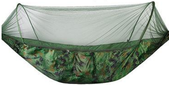
Camouflage (Green Net)