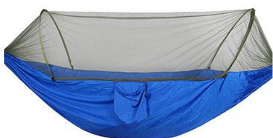
Blue (green net)