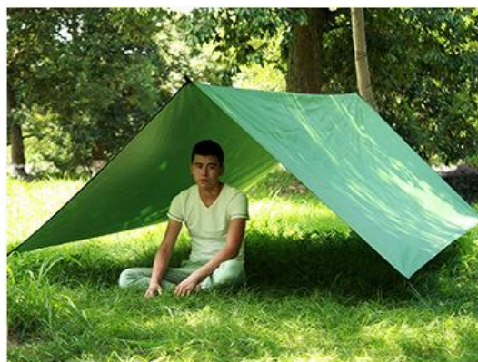
As a simple tent