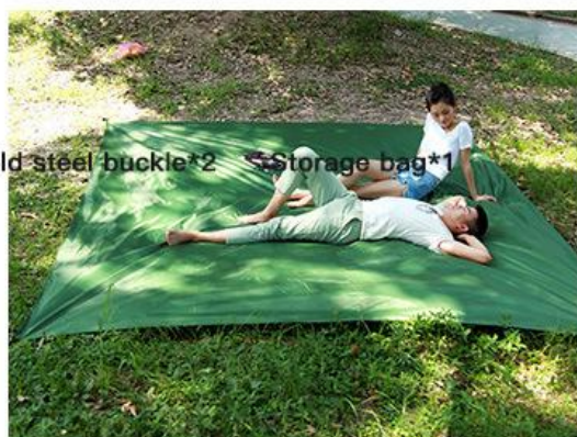
As a picnic mat