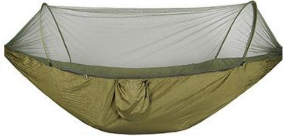
Army Green (Green Net)