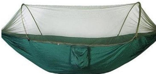
Dark green (green net)