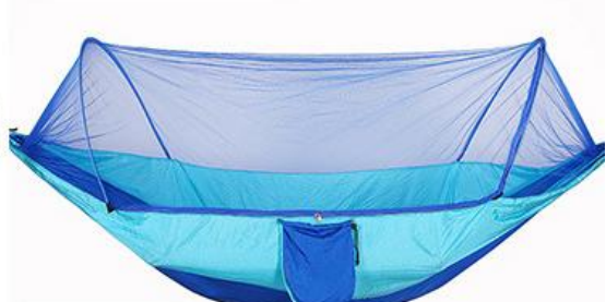
Blue (Blue Net)